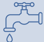
Water & Sewer