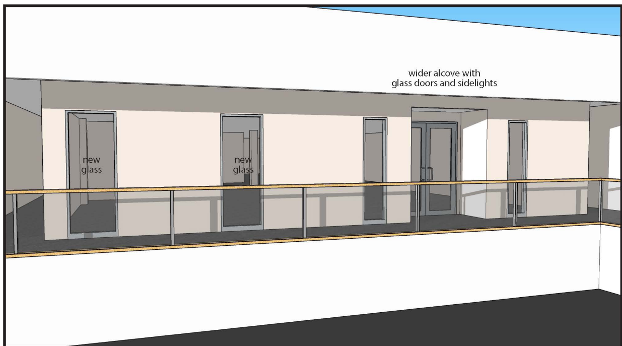
99 Rosewood Dr - Suite 240 Proposed Exterior