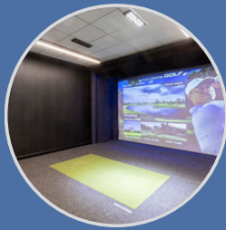
State-of-the-art golf simulator

Ferencroft Corporate Center is a suburban oasis where businesses thrive off urban-style convenience. From the 12.5 acres of beautiful grounds and sweeping views of the suburban landscape, after a $4 million re-investment to the full-service cafeteria, tenant lounge with state-of-the-art golf simulator and fitness center, Ferencroft is truly the best of both worlds.