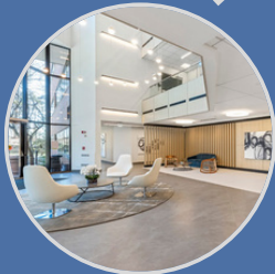
Lobby with high-end finishes