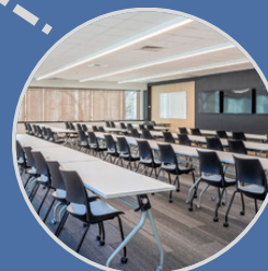
Conference center with configurable seating and established AV amenities

The information above has been obtained from sources believed reliable. While we do not doubt its accuracy, we have not verified it and make no guarantee, warranty or representation about it. It is the responsibility of all parties interested to independently confirm its accuracy and completeness. All parties may solicit their own advisor (s) to conduct a careful, independent investigation of the property to determine to your satisfaction the suitability of the property for your needs.