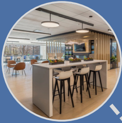
Full-service cafeteria and seating for 160 people