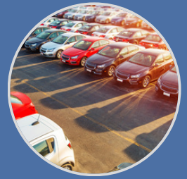
Extensive parking , including covered executive parking